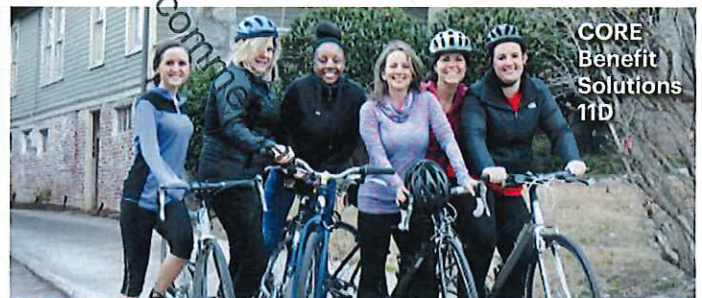
CORE Benefit Solutions 11D