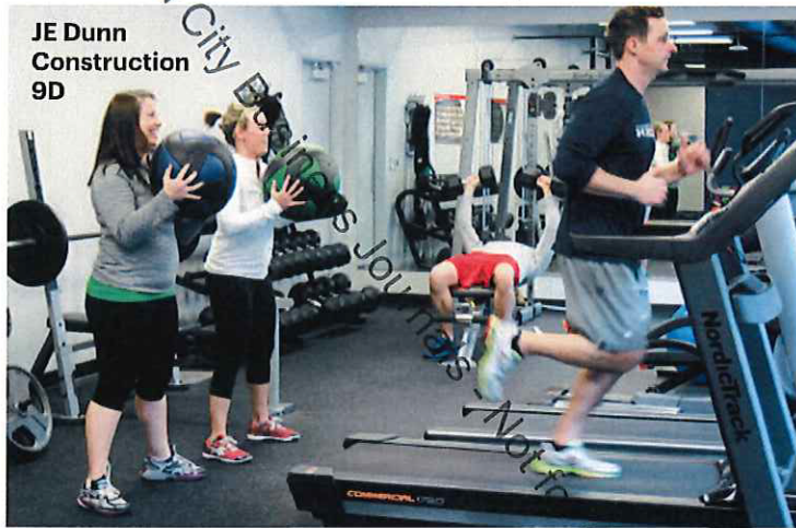
JE Dunn Construction 9D

SPECIAL SECTION February 13-19, 2015 SECTION D