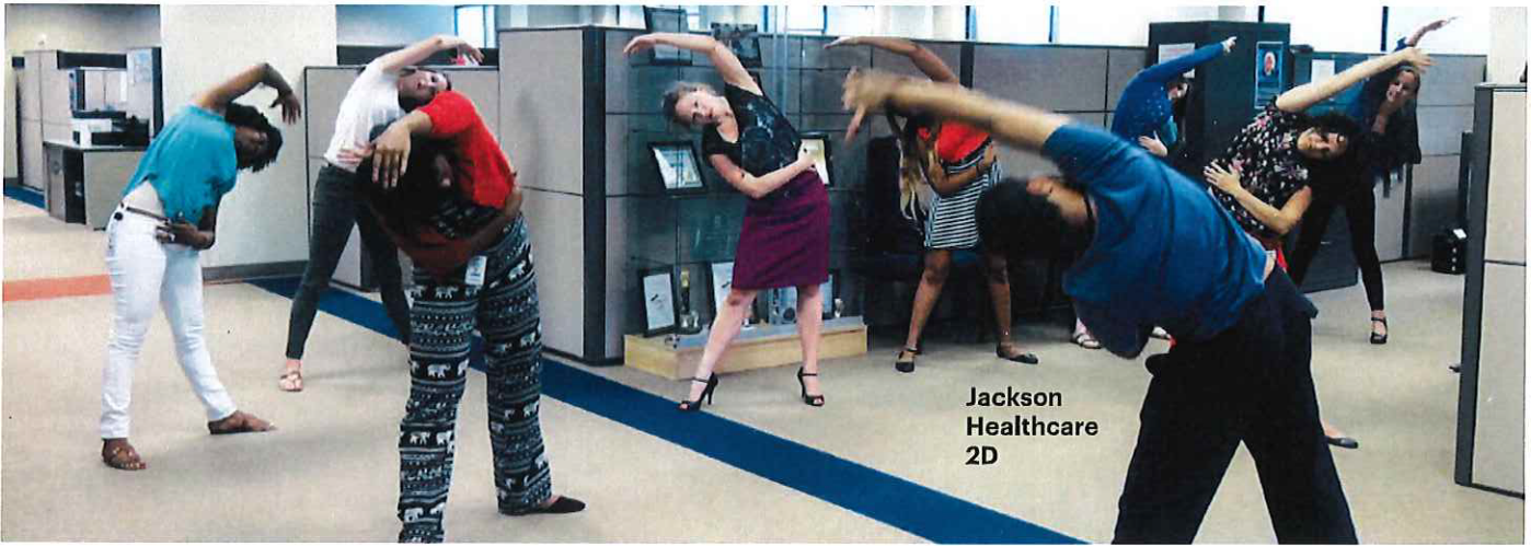
Jackson Healthcare 2D