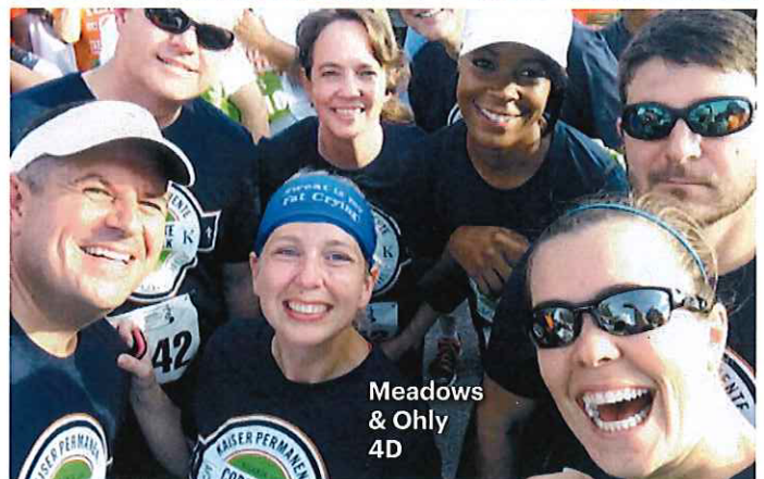
Meadows & Ohly 4D