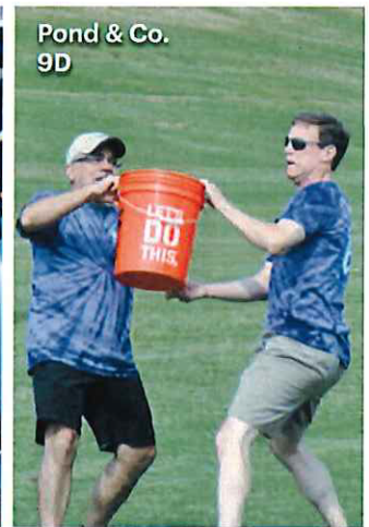
Pond & Co. 9D